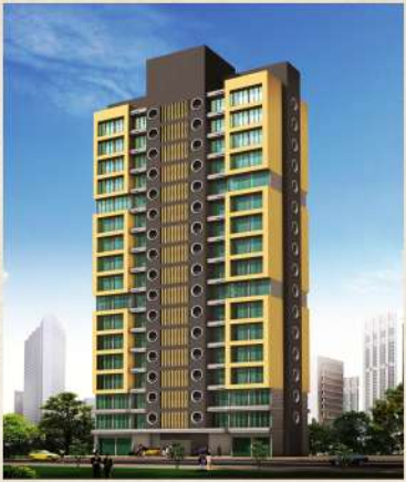
VIDYA DARSHAN - VIKHROLI