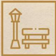
SENIOR CITIZEN SIT OUT