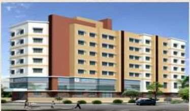
HOSTEL BUILDING - KURLA

And done other Projects such as Roads, Bridges, Water Supply Projects, Huge water Tanks & other Infra contracts