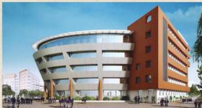
NMMC SCHOOL - KOPARKHAIRANE