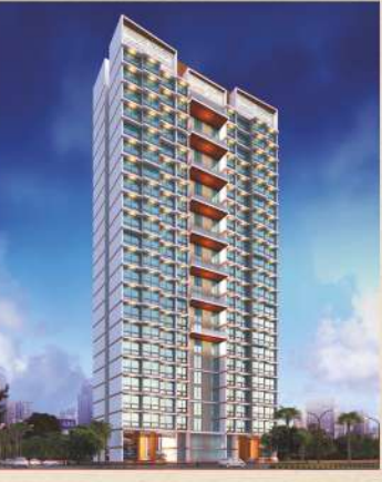
SAI PRASAD - VIKHROLI