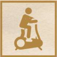
GYM & FITNESS CENTRE ON 8th FLOOR