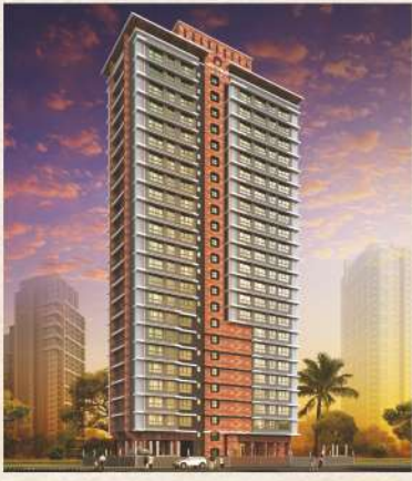
MANORANJAN - VIKHROLI