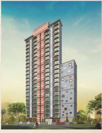
ADITYARAJ PRIDE - SION