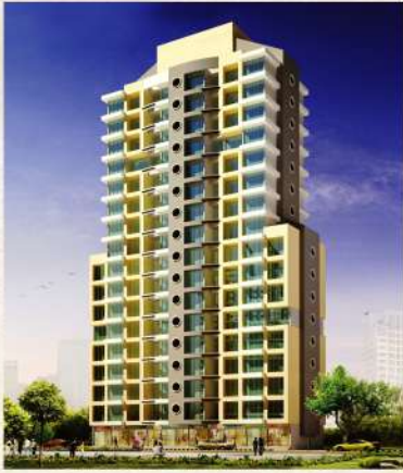
ADARSH AVENUE - VIKHROLI