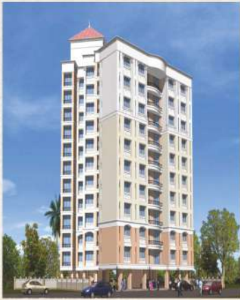
GANGA TOWER - CHEMBUR