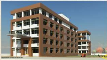
ETC SCHOOL - VASHI