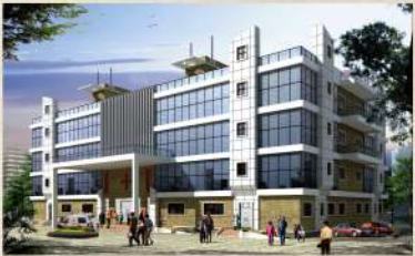
MCH HOSPITAL - BELAPUR