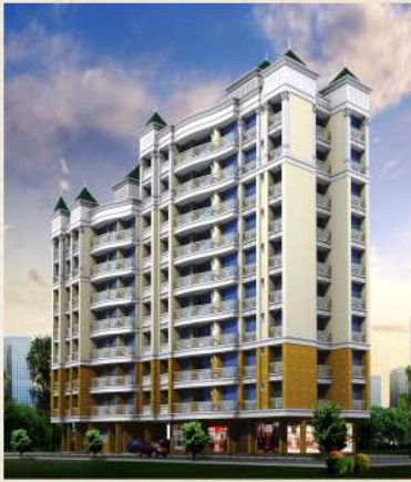
KAMBODHI - CHEMBUR