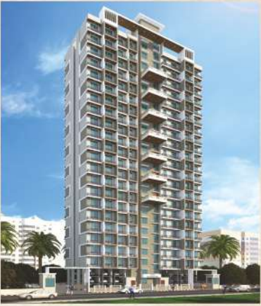
SUYOG SIGNATURE - VIKHROLI