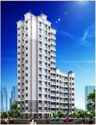
OM SHRI SHANTI - CHEMBUR