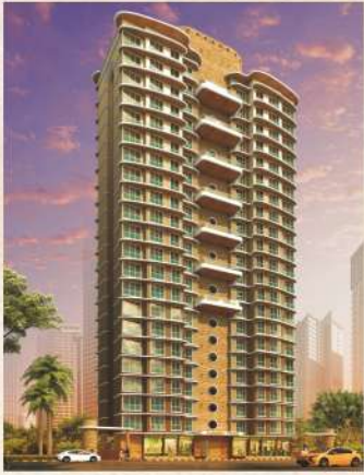
PURNIMA PRIDE - VIKHROLI