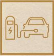
ELECTRIC CAR & BIKE CHARGING