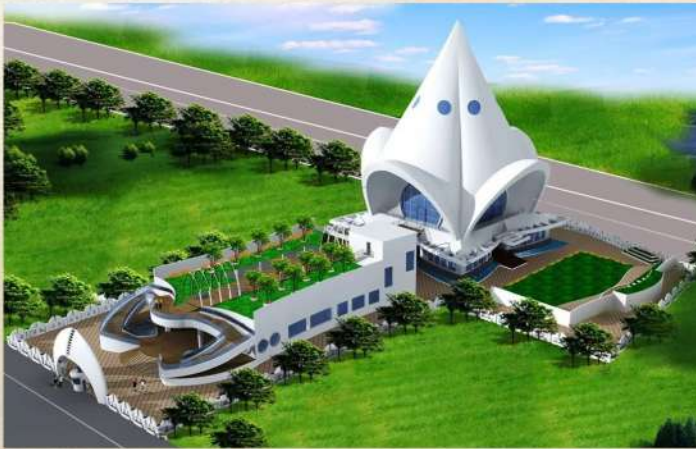
DR. BABASAHEB AMBEDKAR MEMORIAL - AIROLI