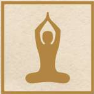
YOGA & MEDITATION